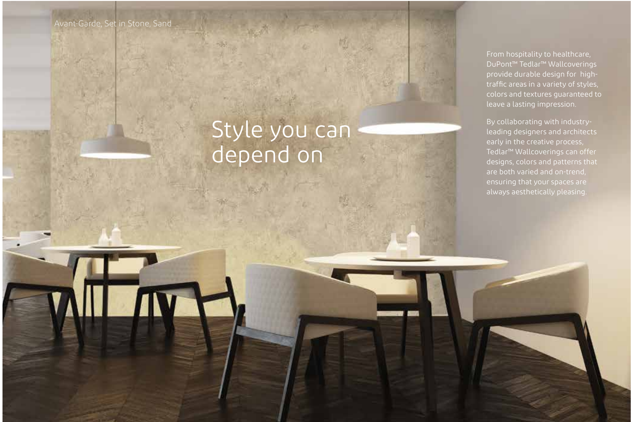
Avant-Garde, Set in Stone, Sand