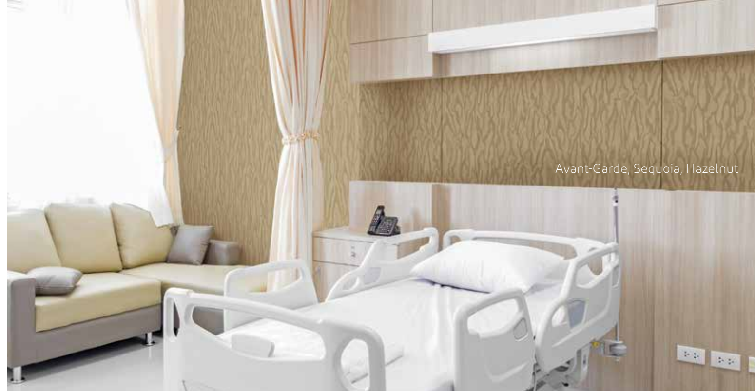
Avant-Garde, Sequoia, Hazelnut

Third-party laboratory testing has proven that Tedlar® film does not support or provide nutrients to assist in mold and bacteria growth, including E. coli .