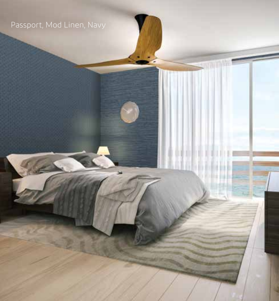
Passport, Mod Linen, Navy