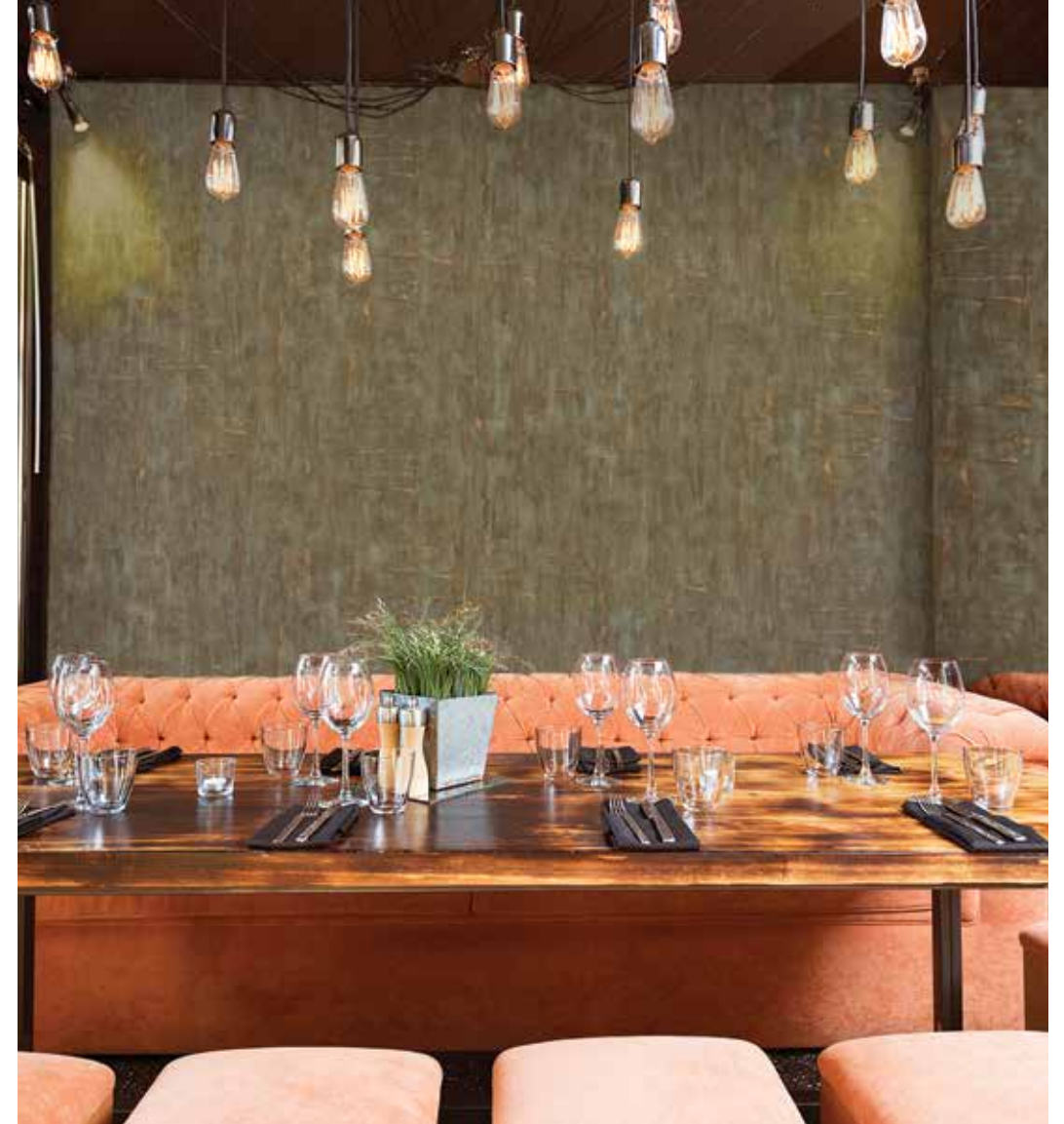
Avant-Garde, Alloy, Steel