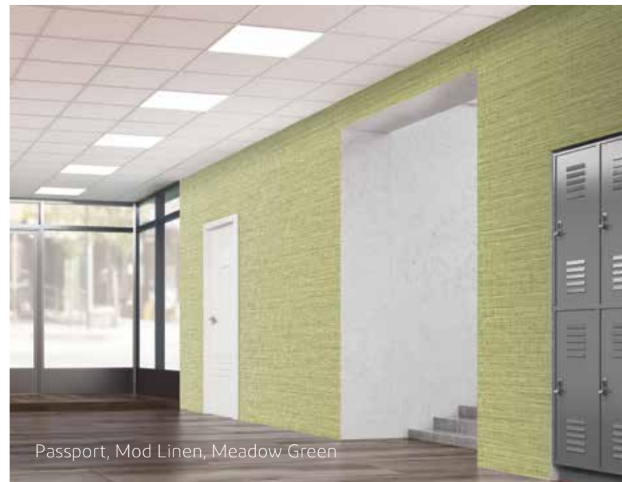
Passport, Mod Linen, Meadow Green